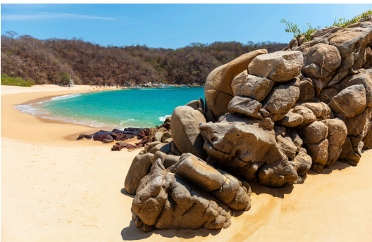
Beaches in Mexico