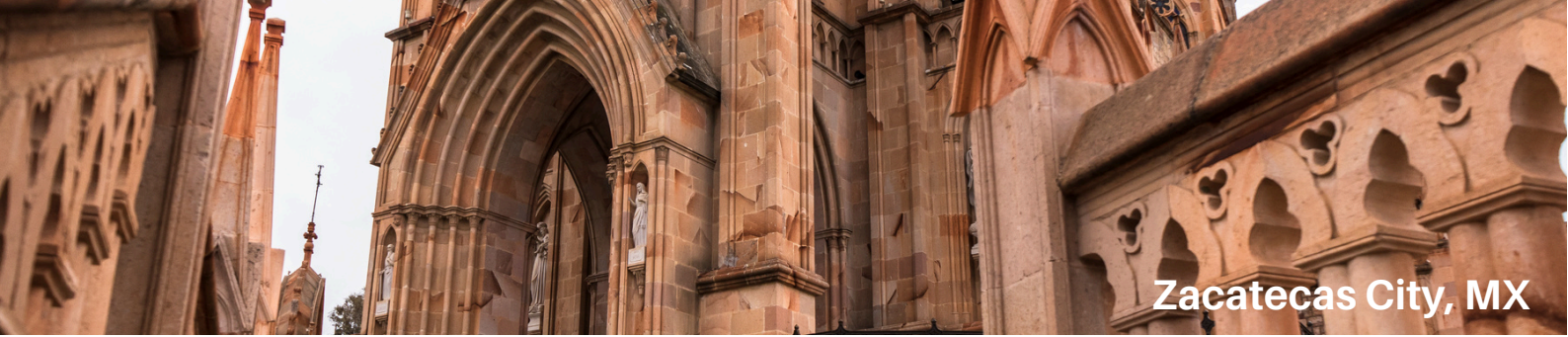
Zacatecas City, MX