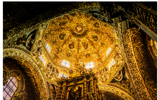
Churches in Mexico - All Cities