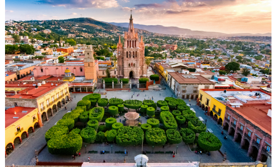
San Miguel de Allende